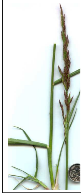
* Festuca elatior – Tall Fescue Exotic tufted perennial to 1.2 m festuca L. stalk, straw; elatior taller (taller than usual in genus) Native of Europe ☼