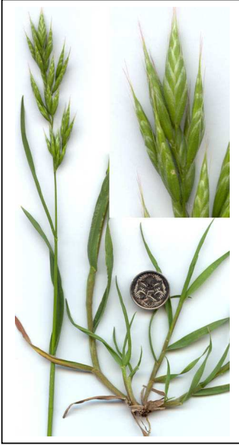
* Bromus molliformis – Soft Brome Exotic tufted annual to 90 cm bromus from Gr. for oats, mollis L: soft Native of Mediterranean region ☼