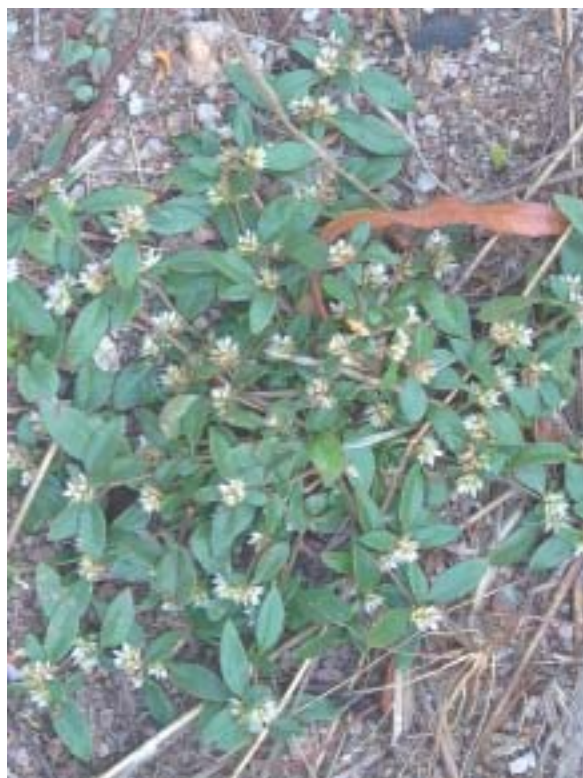
Alternanthera nana Ephemeral native herb alternanthera ref. to filaments without anthers, alternating nana L: dwarf ☼

The diagram in the next column (from page 18 of 90) is A guide for the visual assessment of weed infestation as a percentage of ground cover .