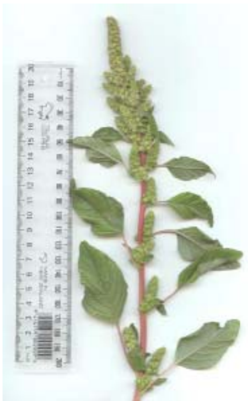
* Amaranthus retroflexus – Redroot Amaranth Exotic annual to 1m Native of America

This very aggressive plant is growing vigorously beside the maintenance track above Lincoln Close – presumably brought in by service vehicles. ☼